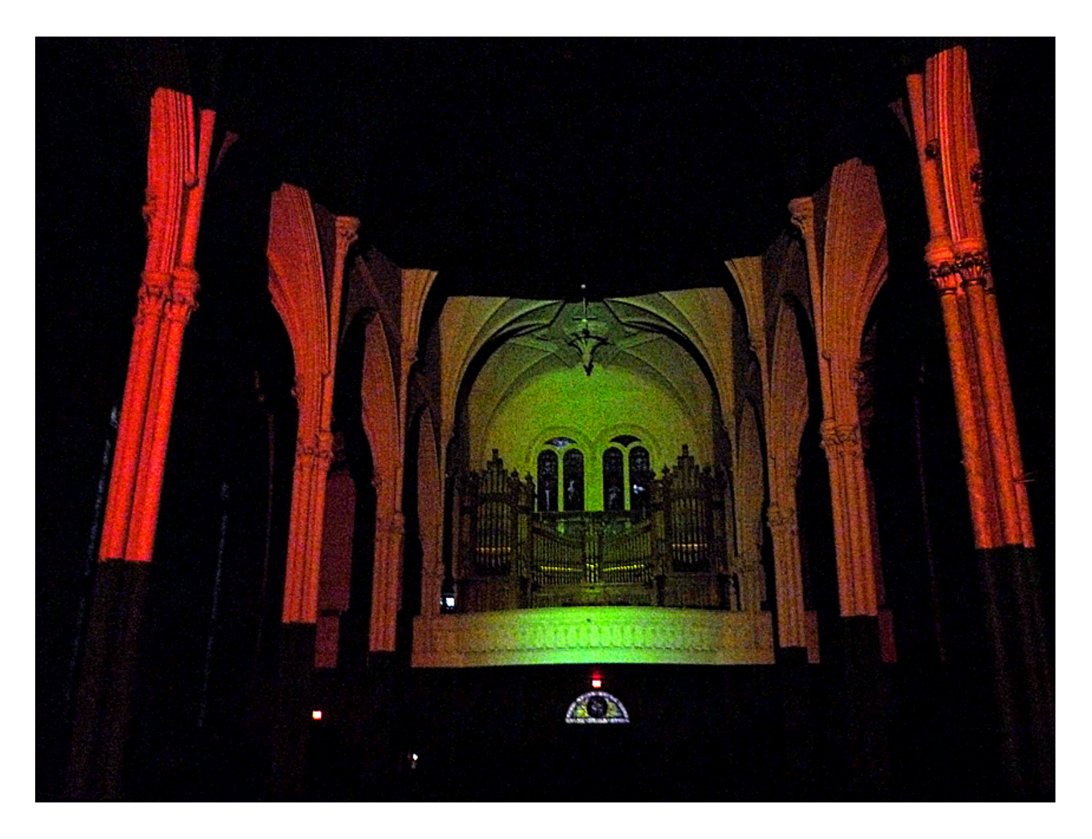
Anne Katrine Senstad - "Kinesthesia for Saint Brigid" (2011), video still

The works with which Anne Senstad most captures the attention of the viewer are the large environmental installations. Through the projection of coloured lights, she tints entire spaces in red, blue, yellow, green, and all shades in between. Combined with specifically composed sound, the visions of colour create a visual poetry leading the viewer to a sensory experience approaching a synaesthetic phenomenon. "The optical illusions experienced when physically enveloped in artificially projected colours, shapes, and sound," Senstad explains, "give way to the momenta of kinesthesia." Such is the experience of her work Kinesthesia for Saint Brigid (2011-12), an installation consisting of a continuous projection of colours in a former church in Ottawa (Canada). Accompanied by pulsating background music, composed by JG Thirlwell , the work gives rise to a transcendental experience of art. "It's about creating life in an enclosed and uninhabited space," says Senstad. Inspired by Plato's "Cave and Pharmakon," the sensory and perceptive aesthetics are combined with spatial relations, structures of architectonic spaces, and retinal experiences of the prisoner's cinema.