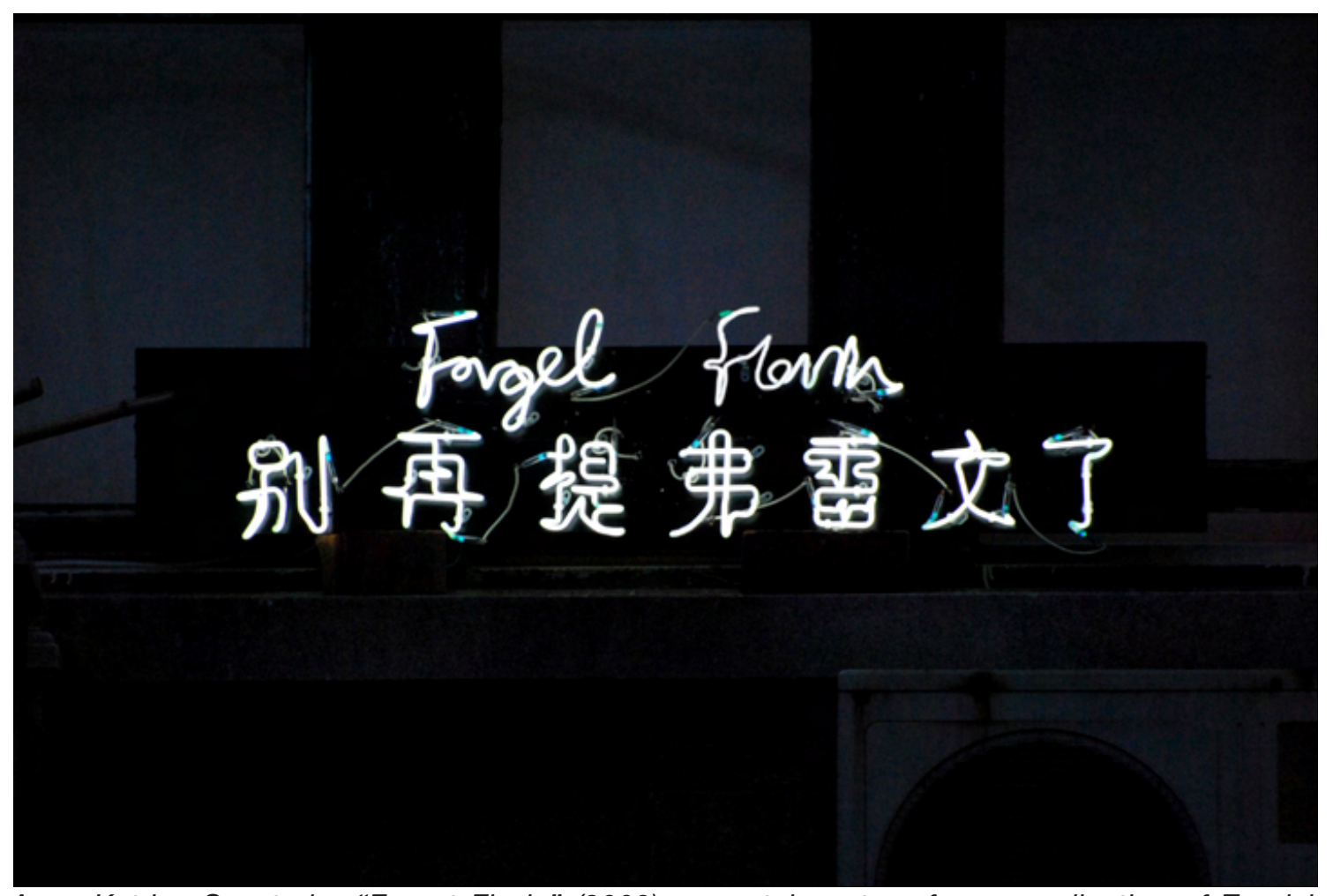
Anne Katrine Senstad – "Forget Flavin" (2008), neon tubes, transformer; collection of Zendai Moma, Shanghai

That is to say, "Light writes always in plural," for its range is boundless. It occupies space and seeps everywhere — like water – altering it physically and psychologically.